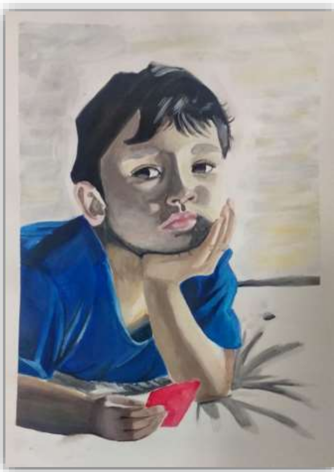
Brother (Watercolour On Paper)