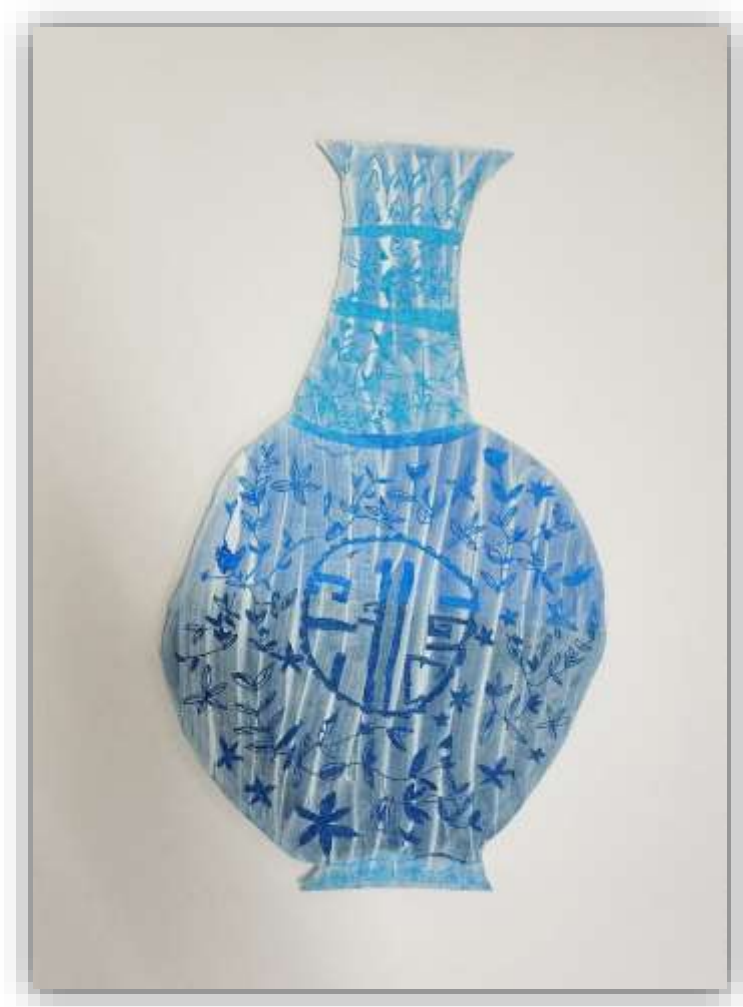
Chinese Blue Vase