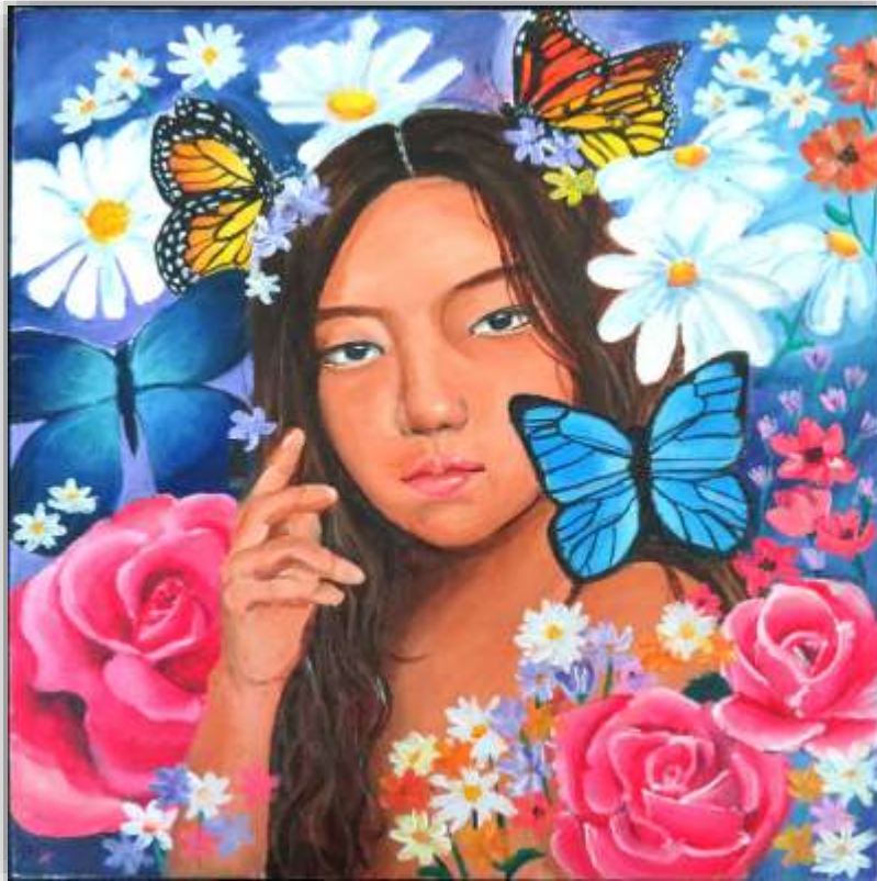
Untitled (Acrylic on canvas)