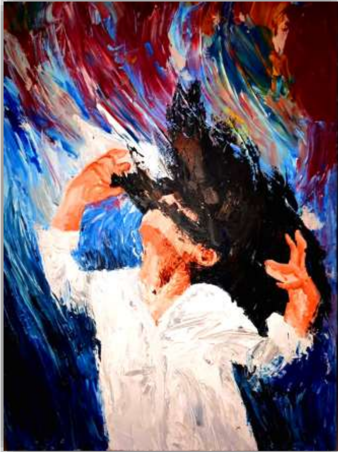
Anguish Within (Acrylic on Canvas)