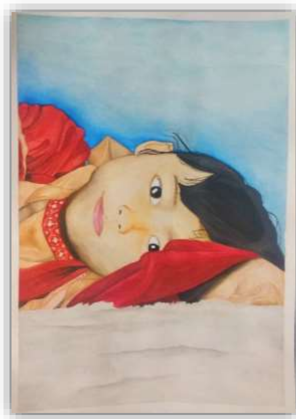
Selfportrait of childhood memory (Watercolour on paper)