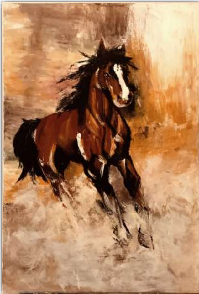
The Horse (Acrylic on canvas)