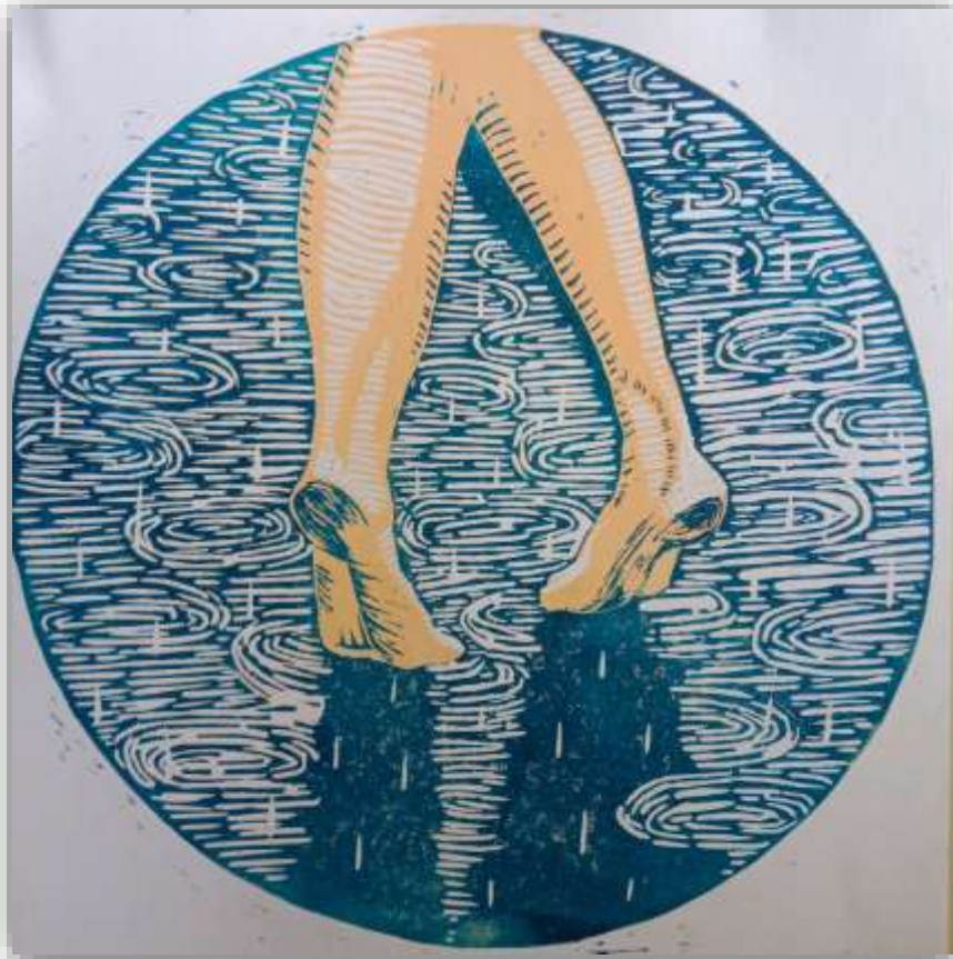
Dancing In the Rain (Lino cut oil printmaking on paper)